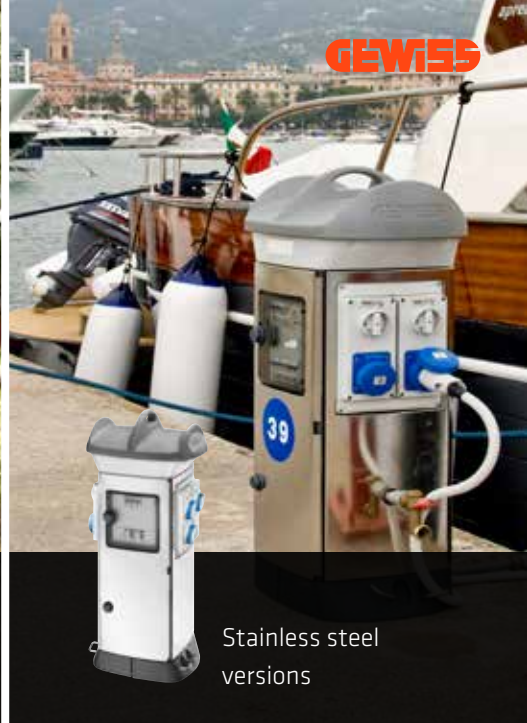
Stainless steel versions