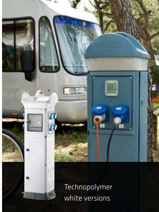
Technopolymer white versions