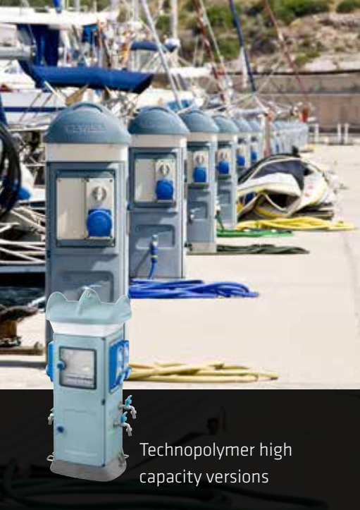
Technopolymer high capacity versions