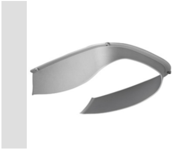
PA66 Visor for the lateral control of light emission.