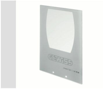
Tempered Glass for street optic for Mercury 1.