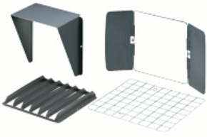
Vizor pentru HORUS 2.